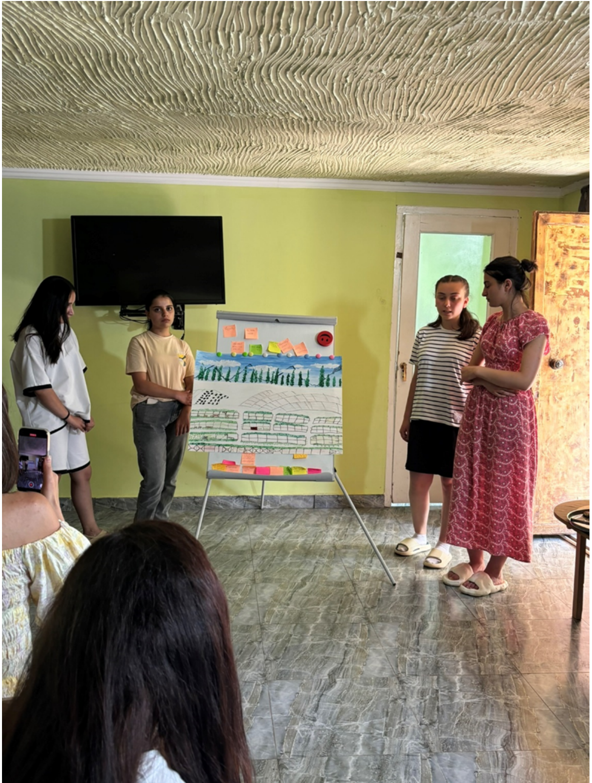
Young people presenting their plans for a Nature Based Initiative