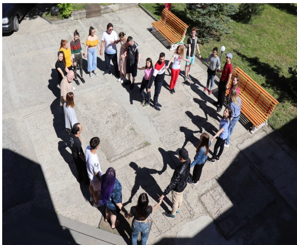
Young people in Armenia taking part in the Pathways to Nature Programme