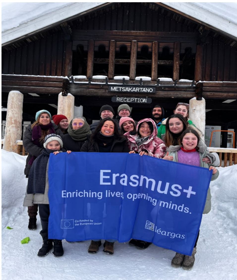
Young People, Volunteers and Youth Workers at Metsakartano National Youth Centre, in Finland, learning about Pathways to Nature in -28 degrees!