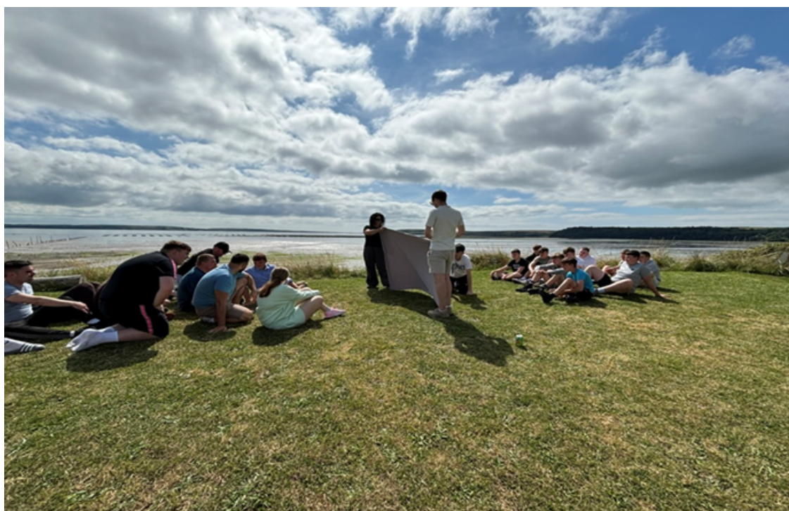
Using the 'blanket game' to get to know each other at Woodstown

5. Tell Your Story: Finally, you'll tell the story of your Nature Based Initiative at a Youth Participation Conference, through videos or photos or speeches – any way you decide yourself.