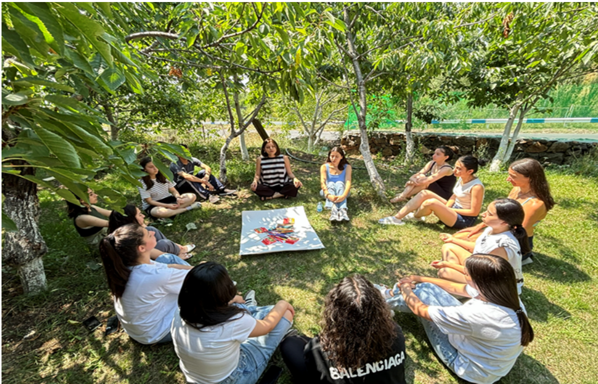
Young people reflecting in the sunshine on the learnings from the Project