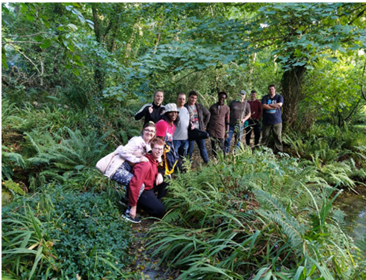
Young people exploring a 'Pathway to Nature'

We're looking for young people who want to make a real difference in their communities and in their own lives, so please take that first step, and join in.